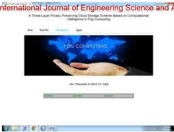
Fig 12: View Requests & Send 4% Data