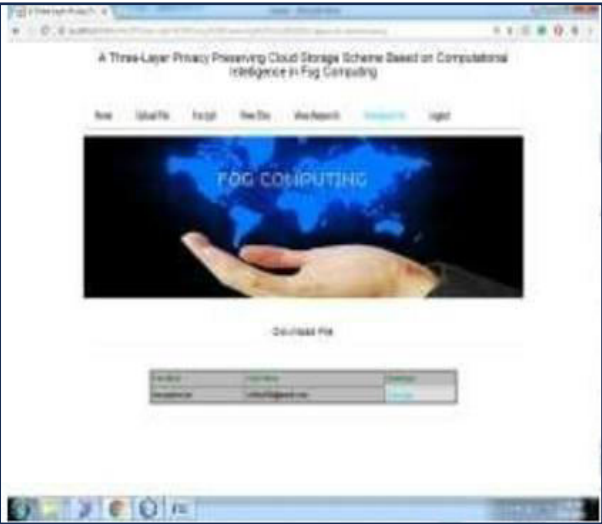
Fig 7: Download Files