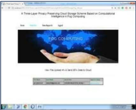
Fig 10: Upload 4% Data