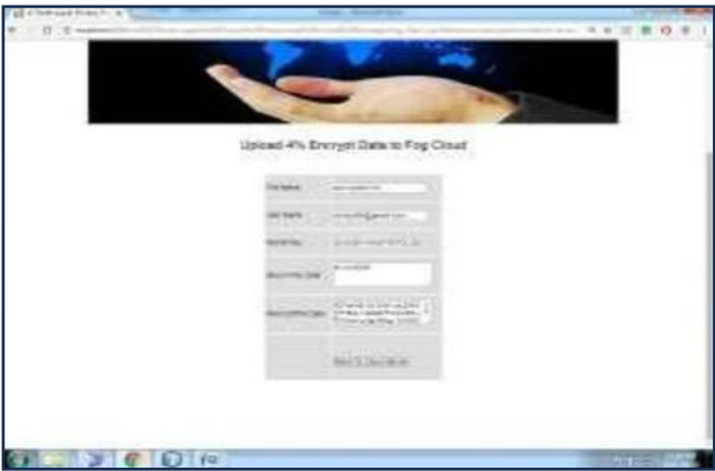
Fig 11: Send 95% Data to Cloud